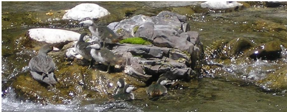
Picture provided by Department of Conservation, Palmerston North of rare blue duck (whio) sighted on Trust lands.

The Trust now, has its own program running, where we check 85 traps every month along Ohuitu ridge to protect the native falcon (Karearea) and 30 traps along Ohuitu stream to protect the blue duck (whio).