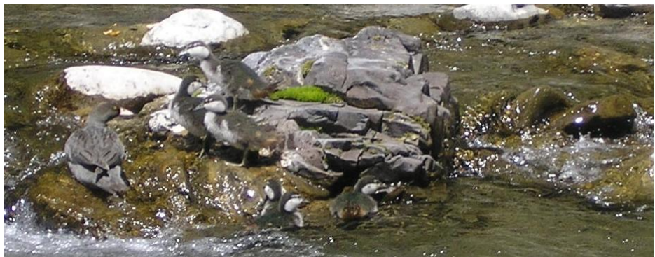
of rare blue duck (whio) sighted on Trust lands.

The Trust now, has its own program running, where we check 85 traps every month along Ohuitu ridge to protect the native falcon (Karearea) and 30 traps along Ohuitu stream to protect the blue duck (whio).